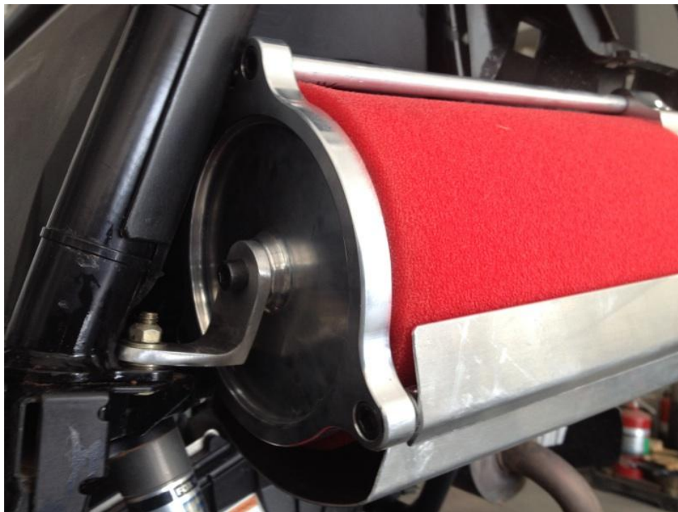
The Filter is mounted through the cage of the RZR – bracket is included.